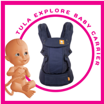
Tula Explore Baby Carrier