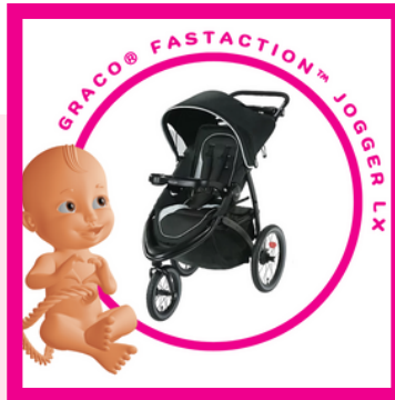
Graco Fastaction Jogger LX