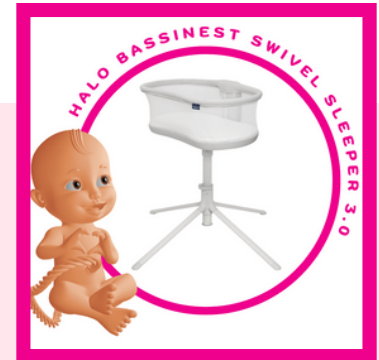
Halo Bassinet Swivel Sleeper 3.0